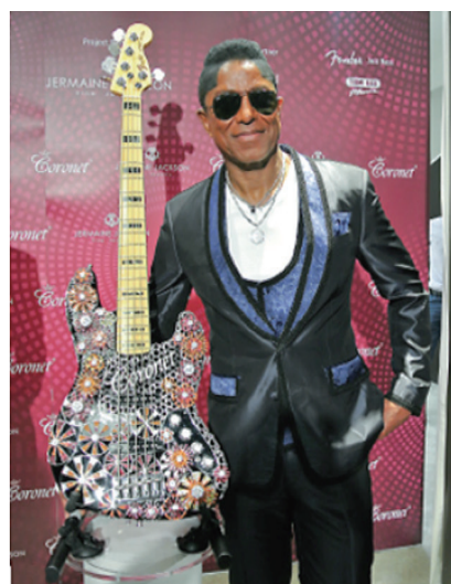
Fig. 3 The World's Most Jewels on a Guitar, Guinness World Record 2016 健力士世界紀錄2016：鑲嵌最多寶石的結他