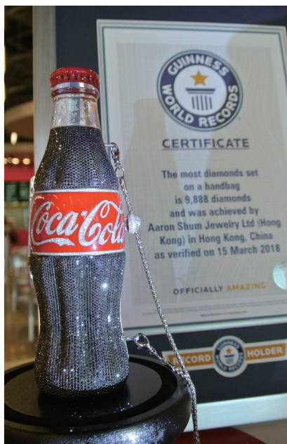
Fig. 2 The Most Diamonds set on a Handbag, Guinness World Record 2018 健力士世界紀錄2018：鑲嵌最多鑽石的手袋