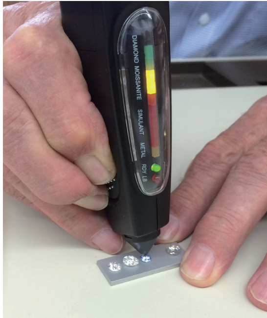
Fig. 4 Presidium Multi-Tester III identifies blue diamond incorrectly by highlighting the yellow section for “Moissanite”

latter a loose stone and in a gold setting. Both blue diamonds were wrongly identified as “moissanite” (Fig. 4).