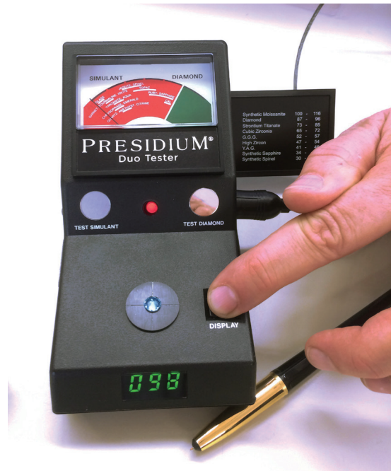
Fig. 3 Duotester in IR-reflectivity mode identifies blue diamond correctly as “diamond”

Presidium Multitester III: this has a different shape, is very handy and as small as a banana. On the tip there is a test probe and the test result is indicated on a luminescent diode scale with sections in different colours. On the upper end this is green and indicates “diamond” (green). The next lower section is for “moissanite” (yellow), followed by “imitations” (red). Testing requires a perpendicular contact of the probe with a clean table. This tester measures thermal conductivity and also electrical conductivity. The stone must be kept in or on metal for the test to function safely and the metal, either a ring or the metal test plate, must be hand-held so that everything is grounded. Mounted stones conduct via their mounting, loose stones conduct over the metal test plate. A measurement of IR-reflectivity is not supplied.