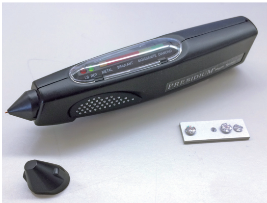
Fig. 1 Presidium Multi-Tester III

Recently, a friend informed me that he had had a problem with a client when he sold him a blue diamond. The handy tool that identified this stone as “moissanite” was a Presidium Multi-Tester III (PMuT III) (Fig. 1). This should not happen! As I am on friendly terms with the producer in Singapore and also know about the worldwide distribution of the instrument I was keen to make my own observations. With a brand new PMuT III, I tested a handful of imitations and diamonds, colourless and coloured, natural and synthetic.