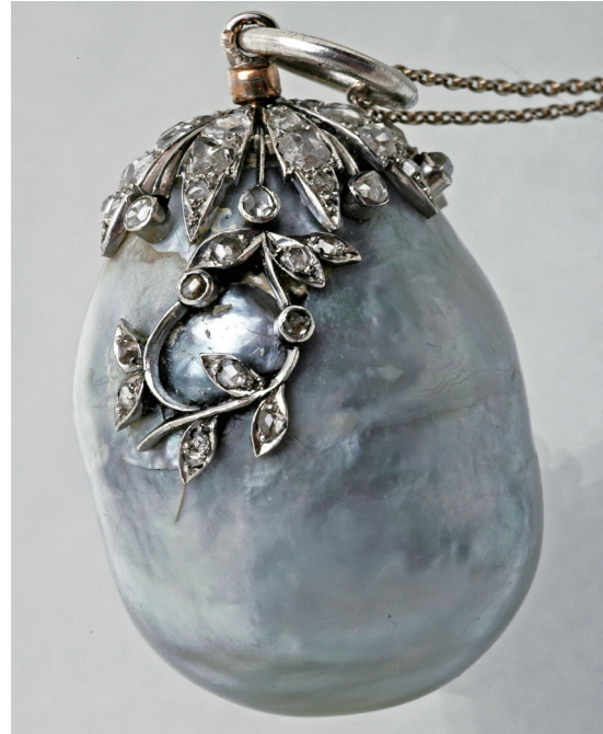
Fig. 4 A large baroque shaped cultured pearl pendant of grey-blue colour. The object is quite light and suggests a large cavity inside.

nacre coating take on the appearance of a light to dark grey stain. We may thus encounter an overlapping of body colours, so grey pearls are not always from Tahitian P. margaritifera oysters (Fig. 4).