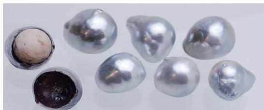
Fig. 3 Larger cultured pearls of grey colour with beads. They have a dark inside lining of decomposed organic matter and a blown up baroque shape.

When oysters are operated on it is not always under aseptic conditions! Occasionally bacterial infections occur and sepsis affects living tissue and toxins develop, even in the pearl pocket. Organic material decomposes and forms black residues and also gases. The necrotic tissue is black and may be situated around the nucleus. The gases may blow up the pearl pocket and a baroque form will take shape. The bead may be loose and difficult to drill. Multiple drill holes witness such formations. Large baroque pearls of grey colour are the result. The necrotic residues shine through the usually thin layer of nacre (Fig. 3). A bad smell is noticed when they are drilled. For Tahiti cultured pearls such a contribution to the general colour is not negative as the pearls are expected to be dark or grey. With white South Sea pearls from P. maxima or white Akoya pearls from P. martensii the grey contribution is less desirable. The necrotic deposits shining through the thin