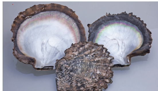
Fig. 1 Pinctada margaritifera shells with a strong dark pigmentation only at the margin. The dark colour fades towards the inside of the shell.

and older people with grey or white hair. The older tissue gradually loses the capacity to form the natural dye. In the same way the mantle tissue of P. margaritifera loses the ability to produce the dark pigment that forms the body colour of dark nacre (Fig. 2). Interference colours are therefore less visible when the dark background is missing. With age the thickness of aragonite tablets also increases slightly, making interference phenomena beyond the visible part of the light spectrum.