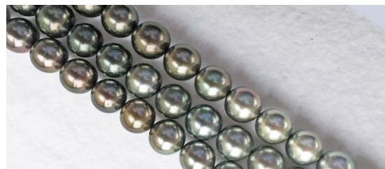
Fig. 2 Three strands of Tahiti Pinctada margaritifera cultured pearls with darker and lighter body colours.