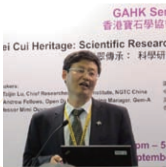
講者：國土資源部珠寶玉石首飾管理中心北京研究所首席研究員陸太進博士