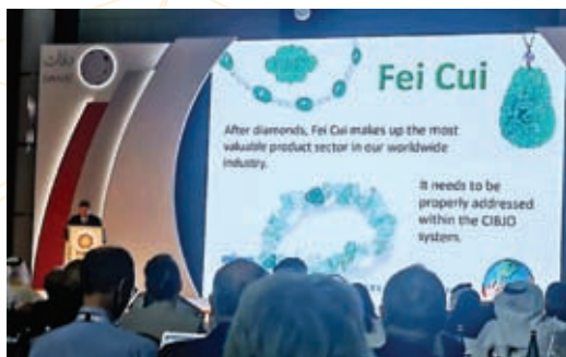
CIBJO Congress 2019 conducts a Fei Cui special session, looking to create international standards for trade in jade products.

國際珠寶業聯盟大會 (CIBJO Congress)於11月18日至20日在中東巴林舉行，大會主席 Caetano Cavalieri博士安排一個焦點會議討論怎樣建立翡翠的國際標準。廖尚宜博士和黃紹基先生(香港珠玉石器金銀首飾業商會理事長，周大福珠寶集團董事總經理)代表香港寶石學協會作了詳細的報告，表達了香港珠寶及翡翠業界的聲音和訴求。CIBJO 主席及參與大會人士對報告內容給予高度的評價與肯定，並接納香港寶石學協會的提案，考慮將"Fei Cui"(翡翠)加入CIBJO Blue Books中。CIBJO Blue Books是一套廣泛為全球珠寶行業接受的寶石分級標準和術語的重要刊物。這是翡翠進入國際珠寶及寶石業界舞臺的里程碑。