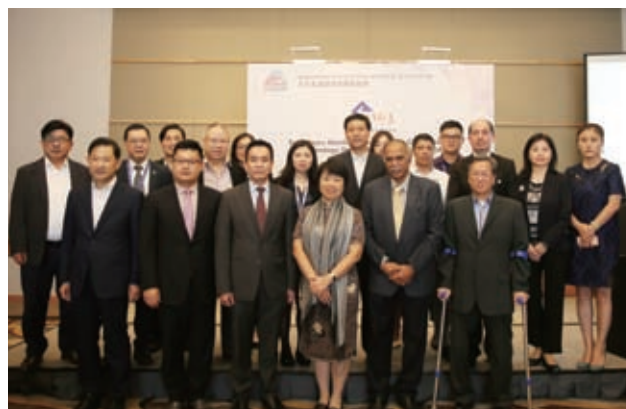
Preliminary Meeting of Asia-Pacific Gemstone and Technology Standardization Alliance (AGA)