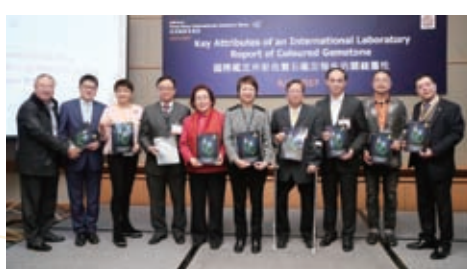
Press Conference of GAHK "Standard Methods for Testing Fei Cui for Hong Kong" (English version)