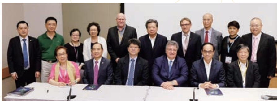
Press Conference of the Chinese version of GAHK "Standard Methods for Testing Fei Cui for Hong Kong"