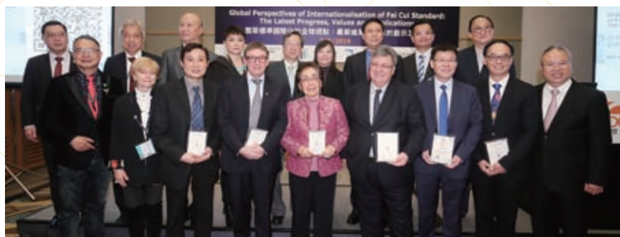
GAHK Seminar on Global Perspectives of Internationalization of Fei Cui Standard: Latest Progress, the Values and Implications

2019年3月香港寶石學協會研討會「翡翠標準國際化的全球視點：最新進展，帶來的啟示及商機」